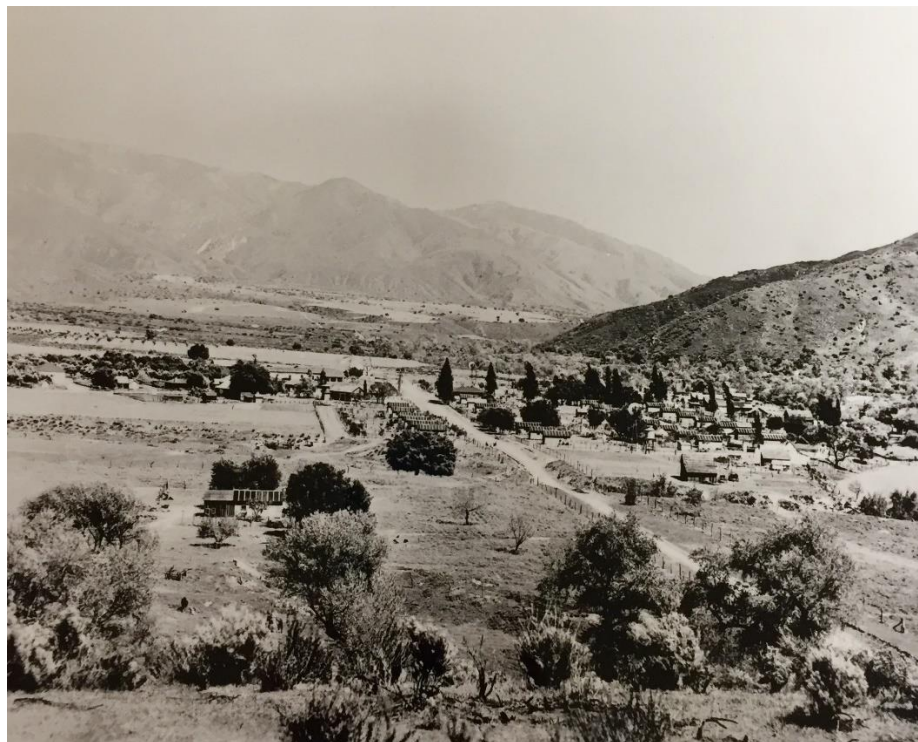
Aerial View of Pala, early 20 th Century